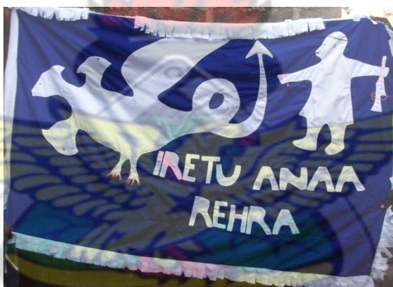
Plate13 The above flag after it has been renewed. The idea and concept still remains but the original design is distorted.