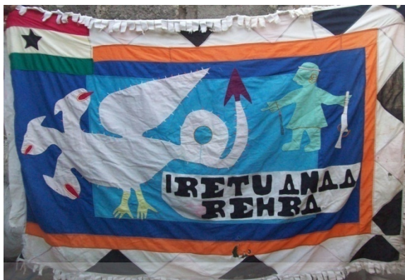
Plate 12: Asafo flag showing the Original design.