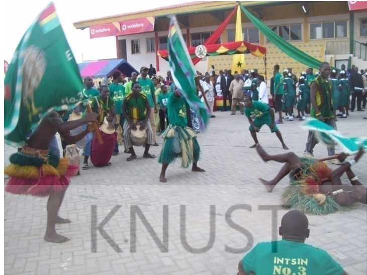
Plate 3. Three Asafo flag bearers ( frankaatufu ) in a spectacular flag display to entertain the audience during the 2009 Oguaa Fetu Afahye .