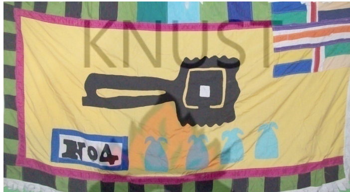
Plate 9 Enam a hwe woho yie

A woman is being celebrated here. This serves as morale booster to women in general that if a woman has been able to establish a town and her descendants are now benefiting from the facilities stated above, then it poses a very big challenge to all women to remain focused to contribute meaningfully to society.