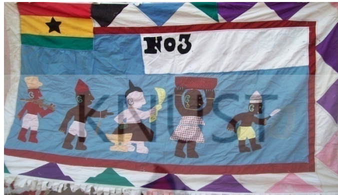
Plate 7 'Abusua'

wives alike should be more dependable like palm tree in their children's upbringing. To whom much is given much is expected.