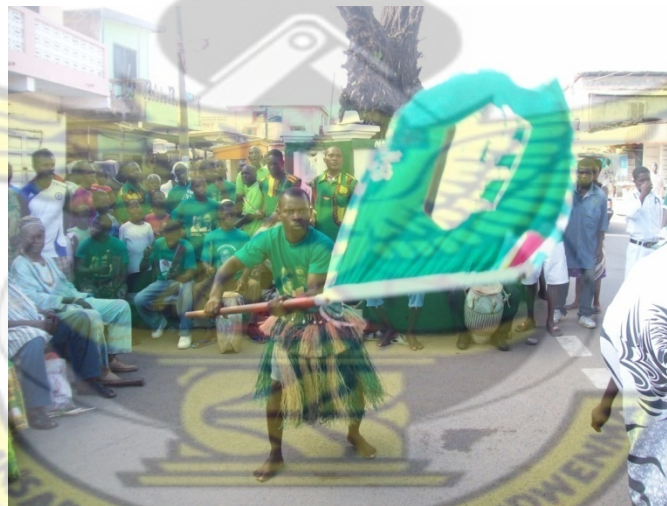
Plate 1. A flag bearer ( frankaatunyi ) of Asafo No 3 exhibiting skills in flag movement to the musical tunes from drummers to the enjoyment of the audience.

This helps to promote peaceful co-existence where social interactions are initiated. Company members directly or indirectly learn about the images in the flags which are very important for the perpetuation of societies. A person may come to observe the flag display but may end up making friends or even meeting a life partner.