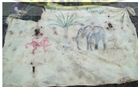
Plate11: The same copy of the flag above which is faded and stained as a result of poor keeping