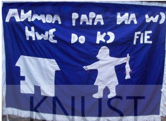
Plate 4: Anamon papa na wo hwe do ko fie (Anaafo No 3. Company)