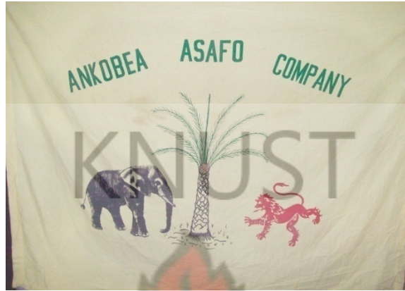
Plate 6 Osono tutu a ɔtwer abe

position to cause positive change and not to sit on the fence to allow situations to get out of hands before they act.