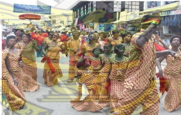
Plate 2. A section of the Bentsir No 1 Asafo group adorned in their colourful outfit and dancing to attract comments from the general public.

Sometimes two or three flag bearers meet during procession and spontaneous flag dance competition is initiated. At the durbar ground, time is allocated for flag display by the Asafo companies. Plate 3, shows a spectacular dance display by three flag bearers at the durbar grounds during the 2009 Oguaa Fetu Afahye . These go a long way to add colour to the festival. The indigenes as well as those who grace the occasion judge the success or otherwise of the festival to the role played partly by the Asafo flags. During such occasions, there is an increase in economic activities. The transport industry, hospitality and marketing of goods get to their peak. There are family reunions where indigenous citizens outside Cape Coast come together and settle disputes, present gifts to parents and also meet old friends.