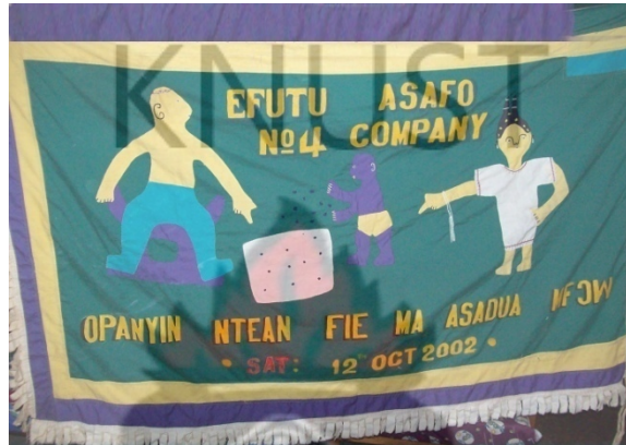
Plate 5 Opanyin ntena fie mma asadua mfow

forefathers should work very hard to protect those properties and even add more. Those who are starting life are admonished by this flag to lead a life worth emulating by earning a good name, accrue wealth, contribute to national development, serve as role models for present and generations yet unborn.