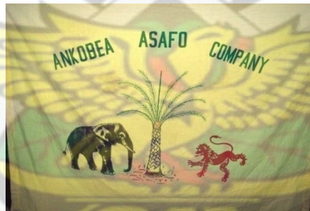
Plate10 A flag which has been properly kept by a sister company.

Without proper documentation, preservation and protection of information on Ghanaian arts and culture, especially for the development of education, posterity will misplace a national asset through the adulteration of our culture in the nearest future. This is the cry of the researcher in that almost all the places visited, the Asafo flags were kept in either a sewn cotton or fertilizer sack and places kept were nothing better to write home about. In some instances, stains can be seen in the flags while some were defaced through insect bite (compare Plates 10 and 11). Unfortunately, none of the Asafo Companies could produce a documentary evidence of their own flags in either hard or soft copy but chiefly relied on oral narration of which facts can be distorted. Again as old flags continued to be renewed, the tendency of changing the original designs of the flags are very high as shown in Plates 12 and 13.