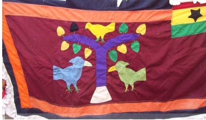
Plate .8 Dua a osow aba pa nna nnoma dzidzi do

Name of flag: Dua a osow aba pa nna nnoma dzidzi do