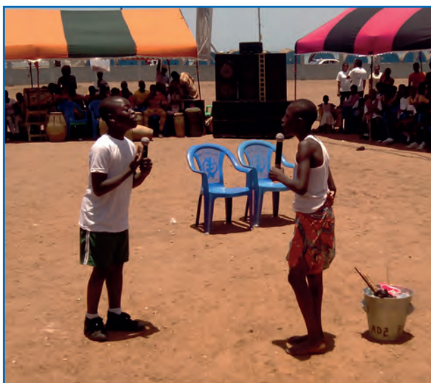
Campaigns delivered through youth theatre have improved support for environmental cleanliness