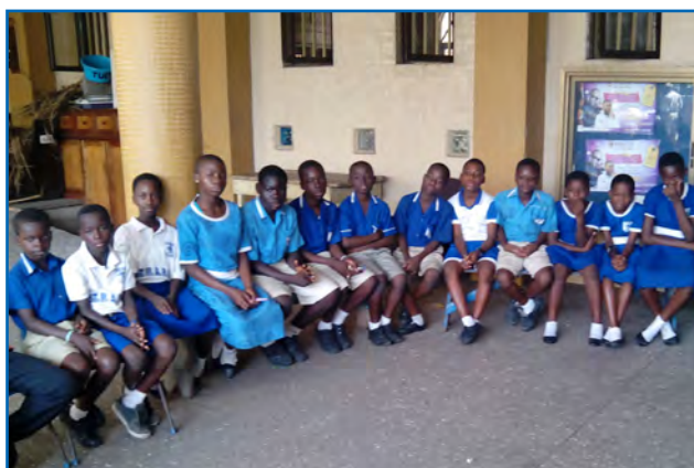
Sensitization in primary schools has highlighted the links between climate change, environmental cleanliness and malaria

mass indoor and outdoor spraying of insecticides, and continued offering of health education programs on the use of the treated mosquito nets. Finally, existing malaria control programs should be extended to all coastal communities.