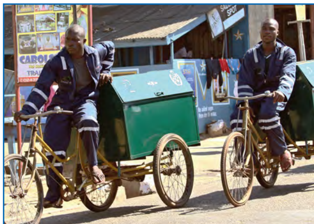
Waste collection and disposal is a source of income for young people

Prevention activities must be year round and should include refuse clearing, drainage expansion and de-silting of choked drains. Providing environmental and sanitation education should also be considered and district by-laws on environmental cleanliness should be strengthened. Other malaria control measures should include destruction of mosquito breeding sites through improved drainage and introduction of fish in ponds to feed on the mosquito larvae,