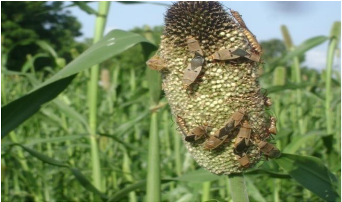
Plate 7: Adult dysdercus spp. Damage on bongo short head at milky stage