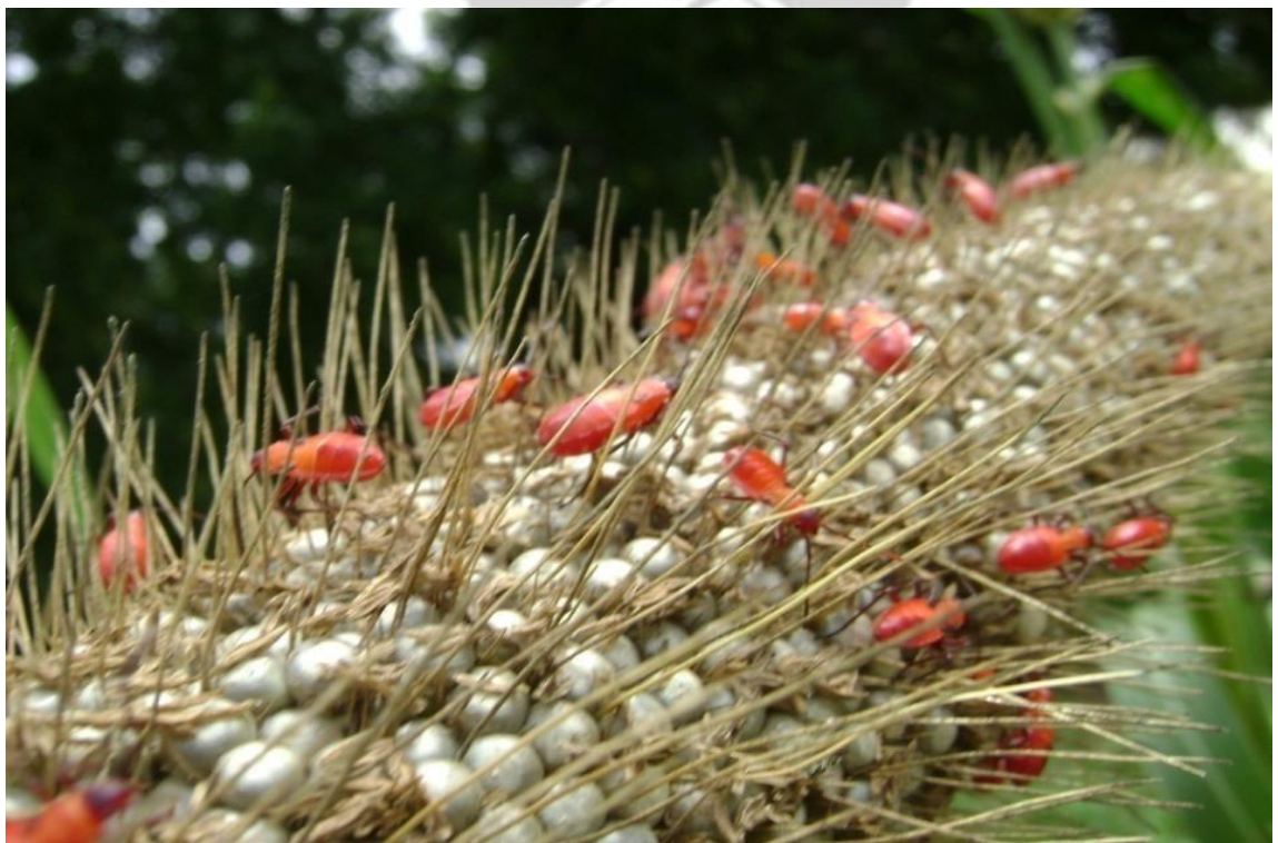
Plate 6 : Nymph of dysdercus spp. on bristled millet head at dough stage