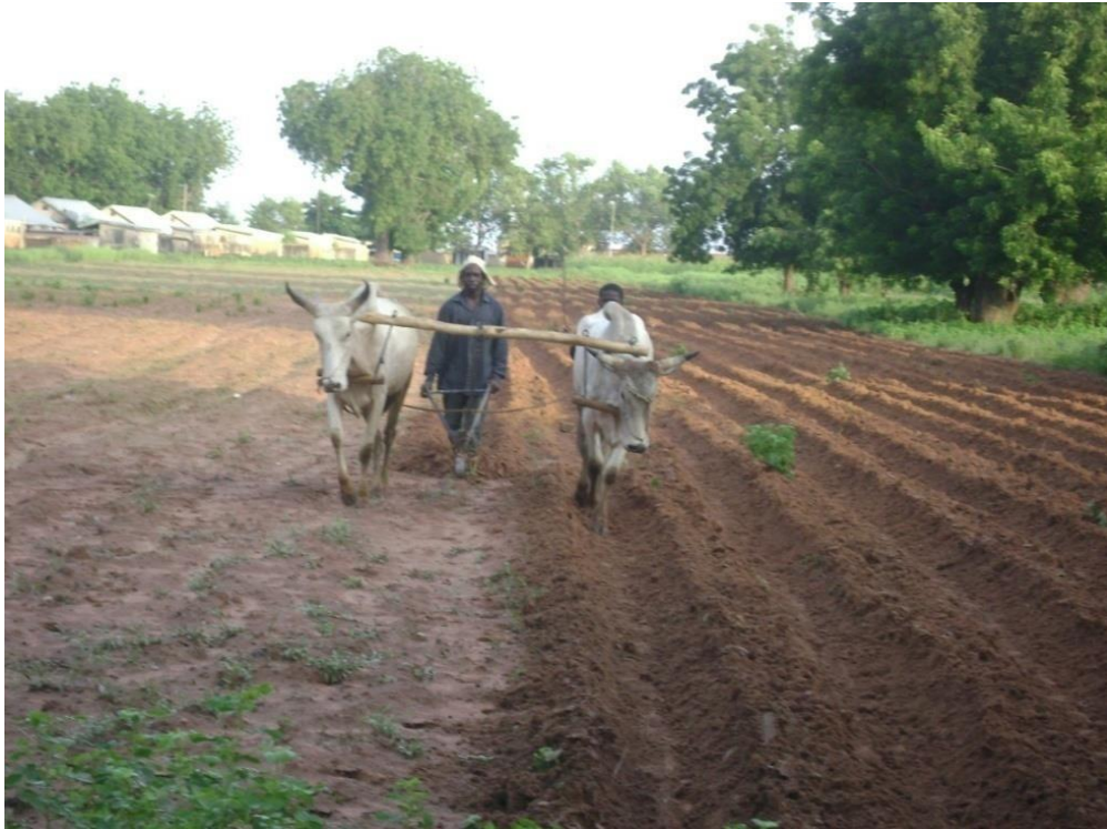
Plate 1: Land preparation with bullocks