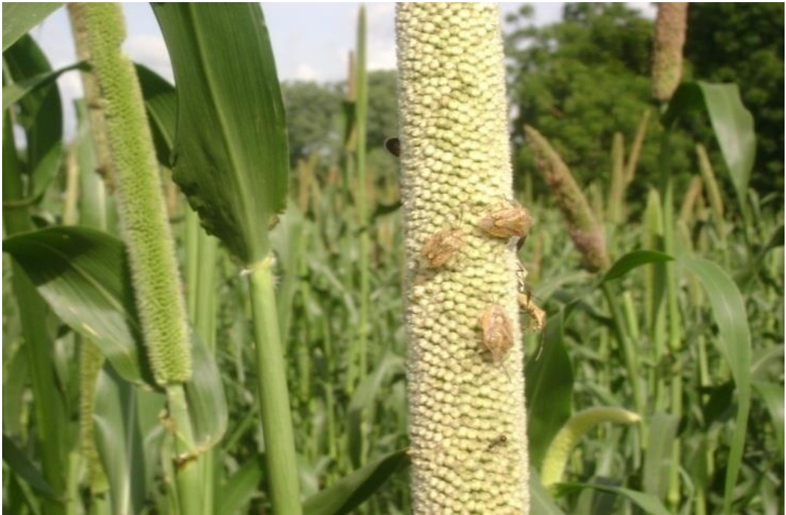
Plate 13: Aspavia armigera infested head at milky stage