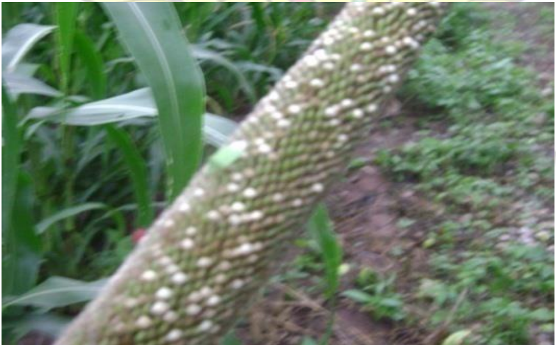
Plate: 10: Stink bug ( Nezara viridula ) damaged head at dough stage