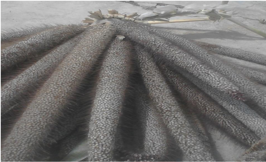
Plate 19 : Bristled Long head