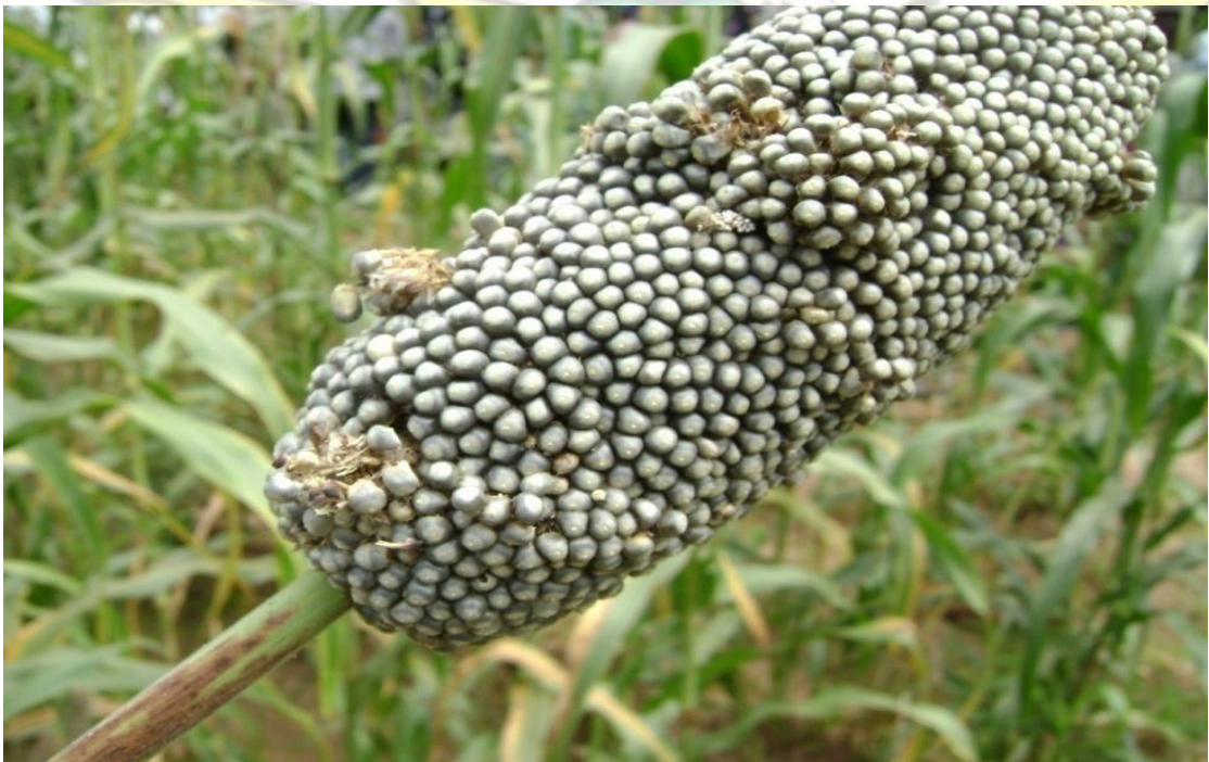
Plate 16 : Head miner larvae damage on bongo short head at physiological maturity stage