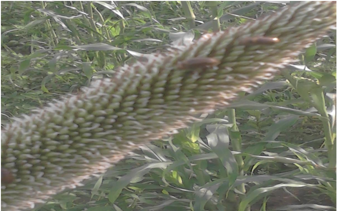
Plate 11 : Flower beetles feeding on millet panicle at flowering