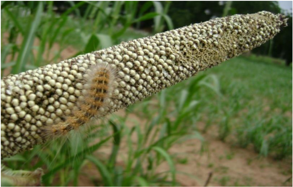
Plate 15 : Amsacta spp. Damage on millet head at soft dough stage