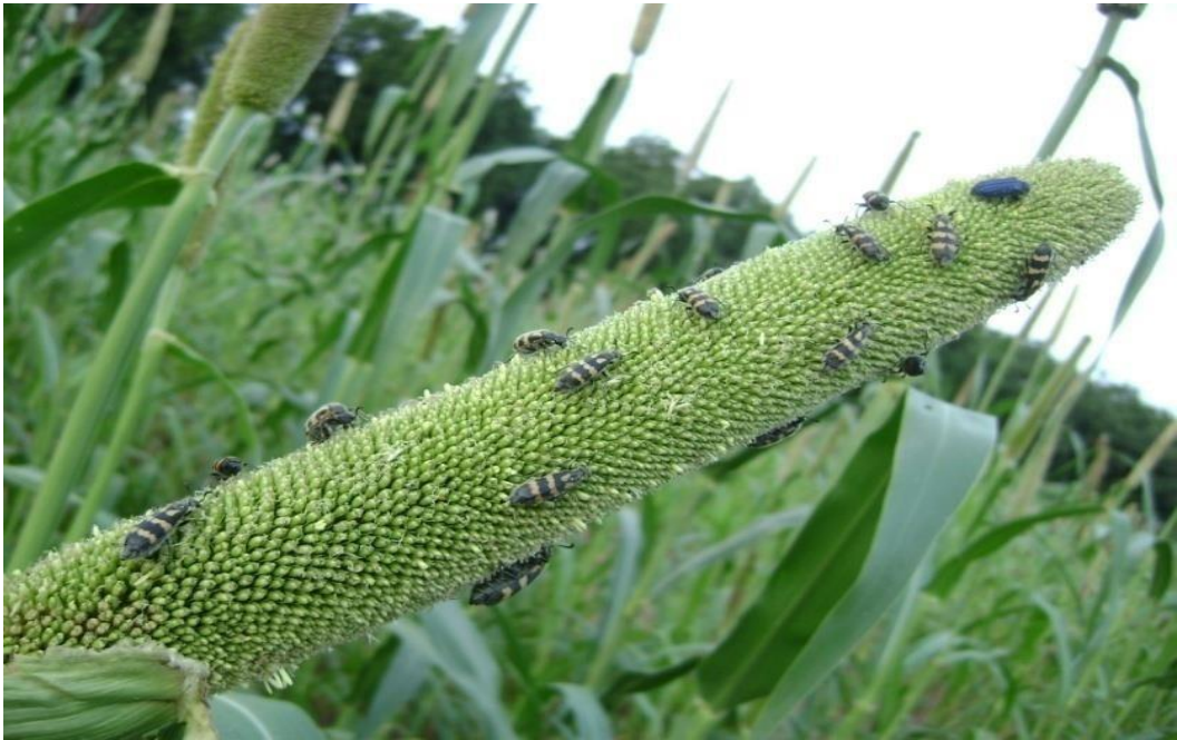
Plate 3: Mylabris spp. Infested Soxat millet head at flowering