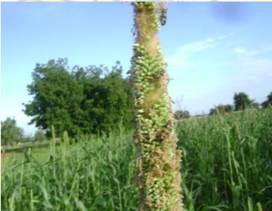
Plate 4: Mylabris spp. Damaged millet head at anthesis