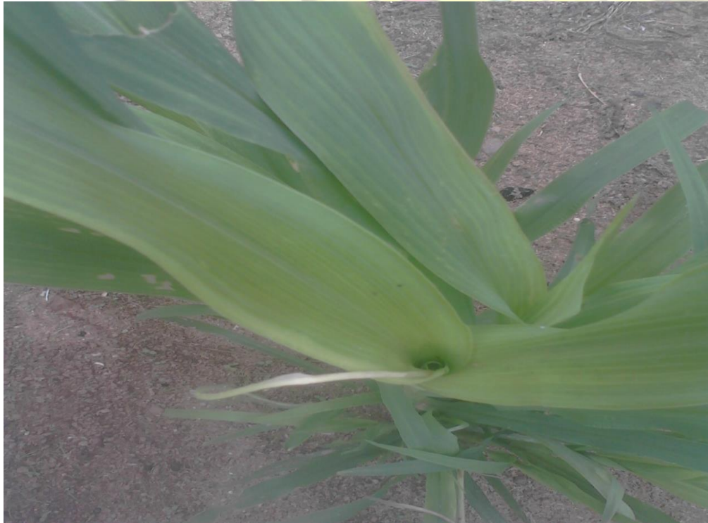
Plate 2: Stem borer damaged (dead heart) plant at seedling stage