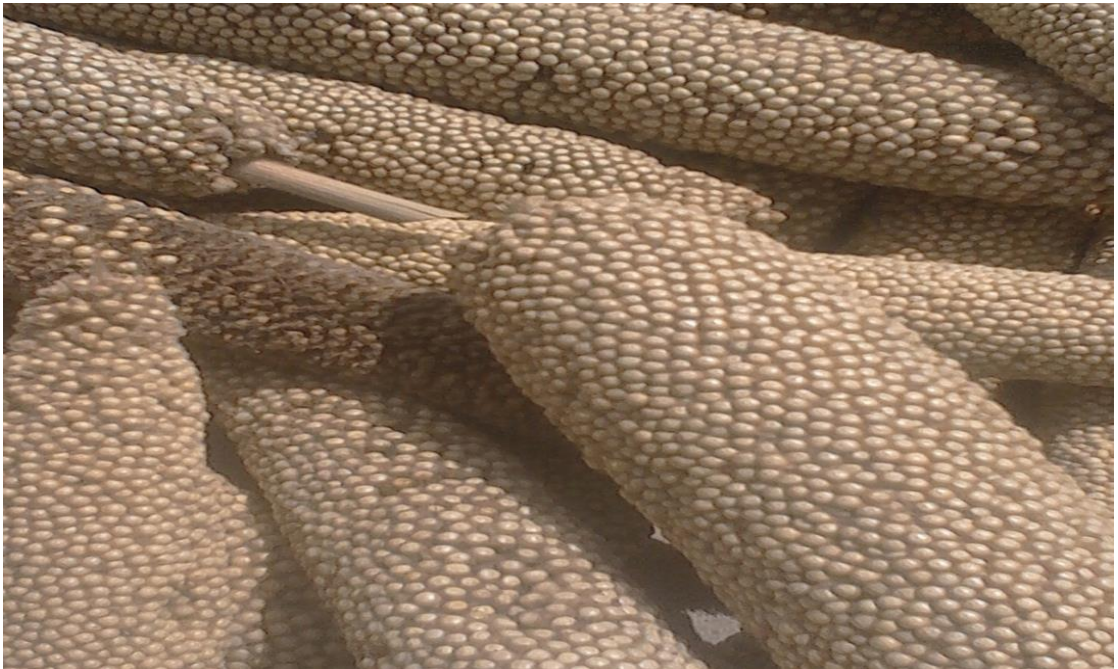
Plate 17 : Tongo yellow millet