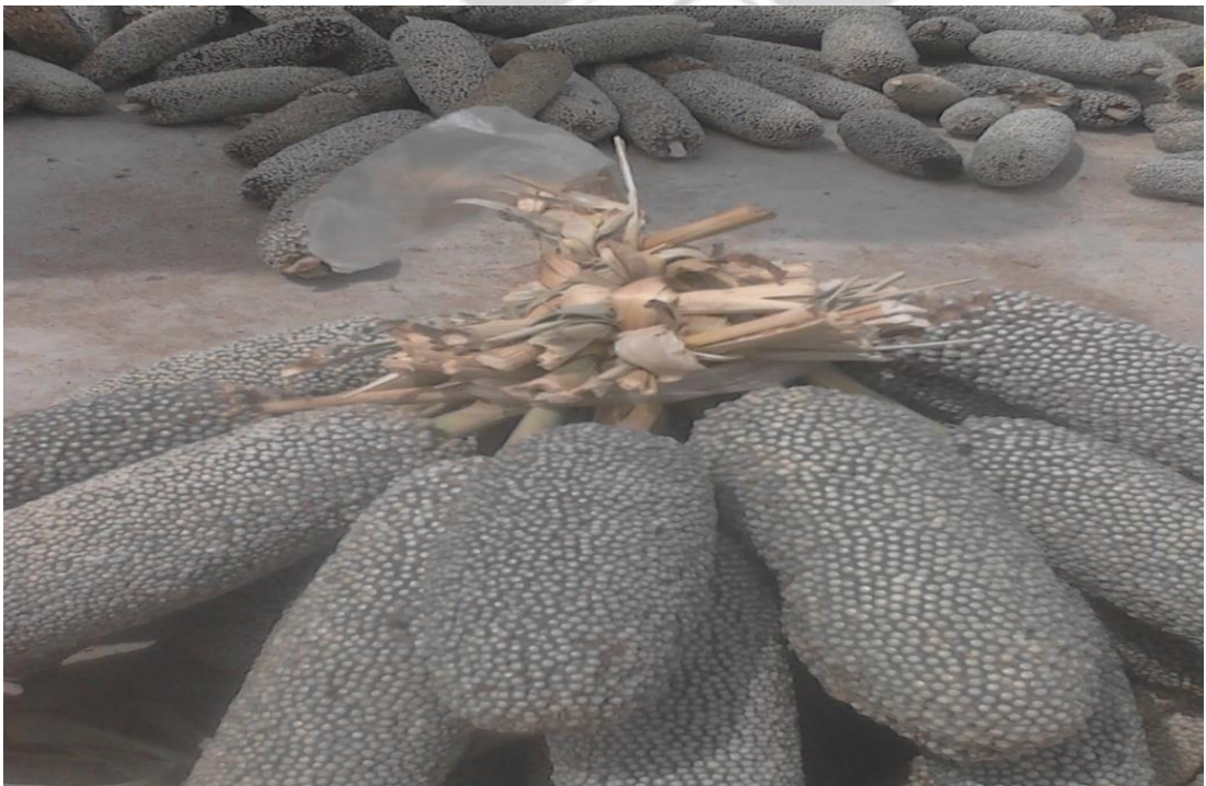
Plate 18 : Bongo short head