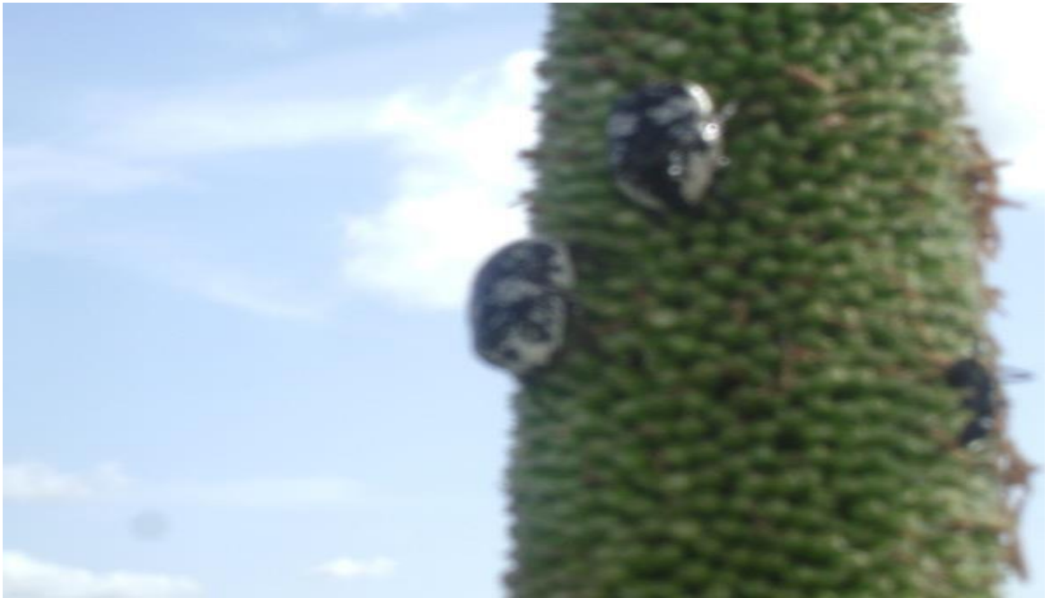
Plate 5 : Pachnoda spp. Infested head at milky stage