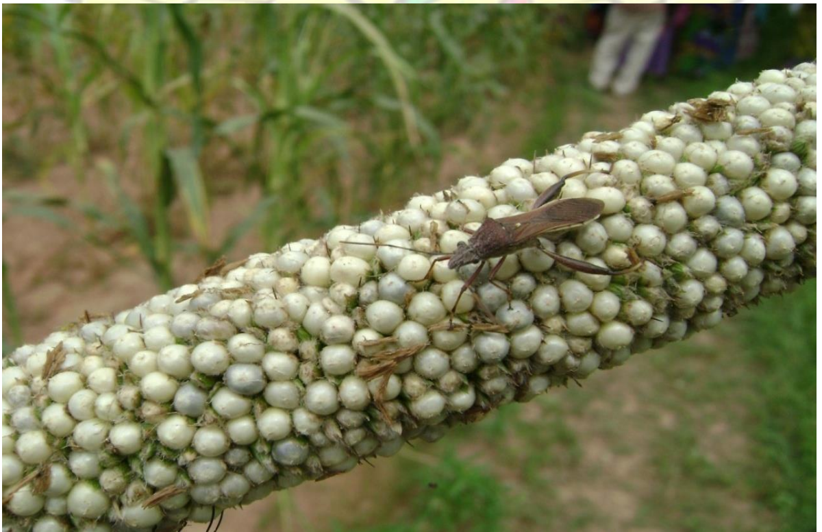
Plate 12: Mirperus jaculus infested millet head at hard dough stage