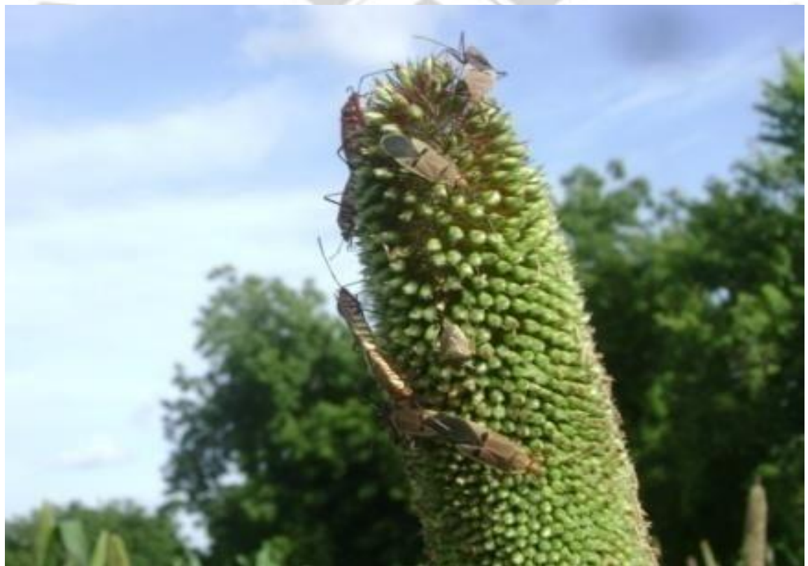
Plate 8: Cotton Steiner ( Dysdercus sp.) infested panicle at milky stage