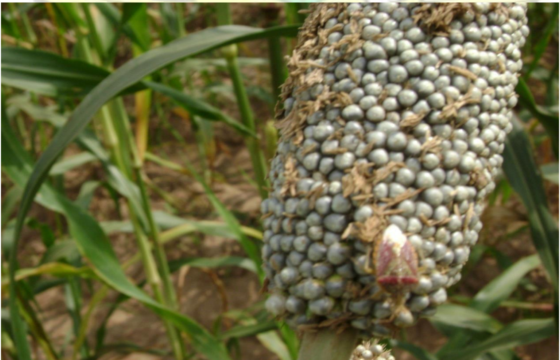
Plate 14: Agonoscelis spp. On millet head at hard dough stage