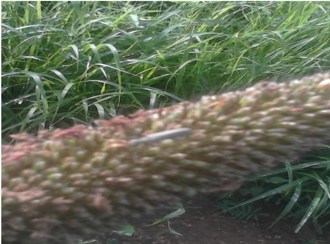
Plate: 9: Psalydolytta spp damaged head at dough stage