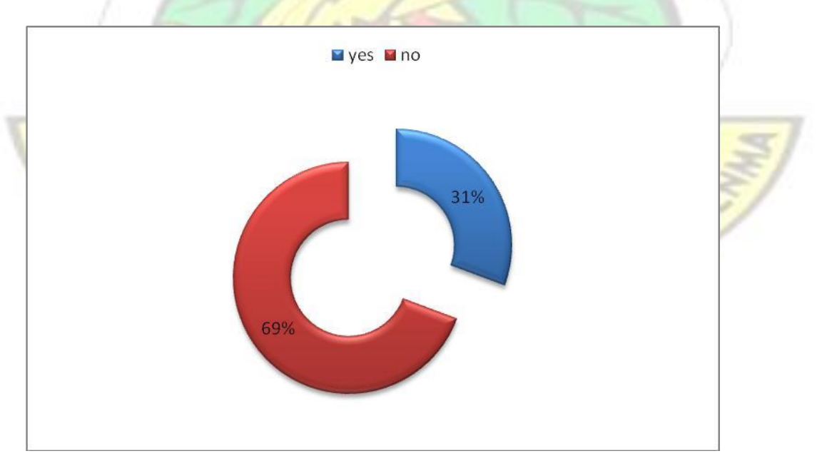
Figure 3: Training on the Public Procurement Law, Source: field survey, 2014.

The researcher wanted to find out from respondents whether they have had any form of training on the public procurement act. Out of 25 respondents, 8 representing 31% of respondents stated "yes" while 17 forming 69% of respondents stated no. Once again all respondents who stated "yes" were all from the headquarters of NVTI. Figure 3 illustrates further.